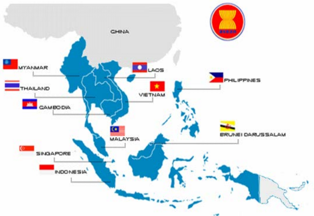
Figure 1. Map of ASEAN

In August 8, 1967, the ASEAN was created to foster cooperation and to promote regional peace and stability through adherence to the principles of the United Nations Charter (ASEAN website). Currently, there are 10-member countries that make up the ASEAN namely Brunei, Cambodia, Indonesia, Laos, Malaysia, Myanmar, the Philippines, Singapore, Thailand, and Vietnam (See Figure 1). ASEAN total population is 604 million (as of 2011) with a working population of at least 263 million (ASEAN Statistics, 2013).